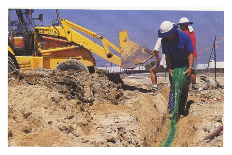
Marker tape being installed in the trench above the pipe

equipment. Tracer wires can also simply be laid with the pipe or wrapped around the pipe during construction.