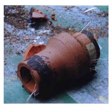
FIG. 13 VC ROLLING RING JOINT WITH ROOTS HAVING ENTERED PAST THE SEAL