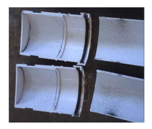
FIG. 12 DISSECTED PVC ASSEMBLY SHOWING ROOTS HAVE NOT PENETRATED PAST THE SEAL