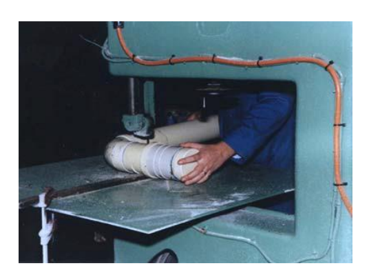
FIG. 10 CUTTING A PVC ASSEMBLY WITH A BANDSAW