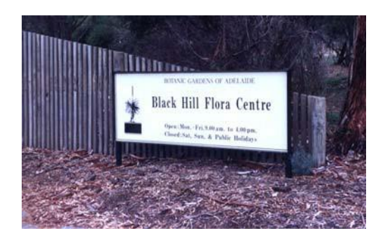
FIG.1 ENTRANCE TO BLACK HILL FLORA CENTRE