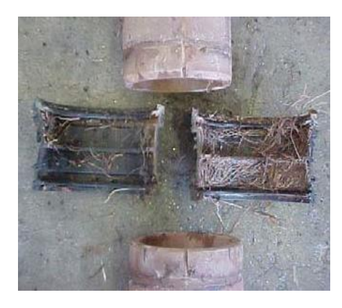
FIG. 14 VC PIPES JOINTED WITH A PLASTICS COUPLING SHOWED A MASS OF ROOT INTRUSIONS WHEN DISSECTED.