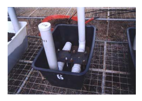
FIG.3 TWO HORIZONTAL ASSEMBLIES WITH 7.5% DEFLECTION APPLIED AND READY FOR BURIAL