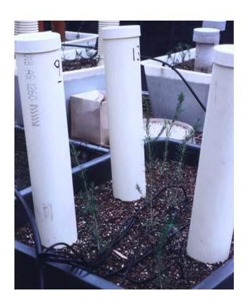
FIG. 4 HORIZONTAL ASSEMBLIES WITH MELALEUCA SEEDLINGS