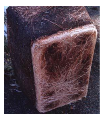
FIG. 8 MELALEUCA ROOTS BINDING ALL THE SOIL TOGETHER