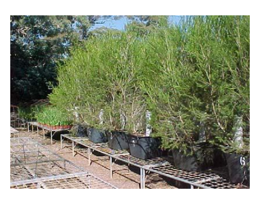
FIG. 7 ASSEMBLIES WITH ESTABLISHED MELALEUCA ARMILLARIS