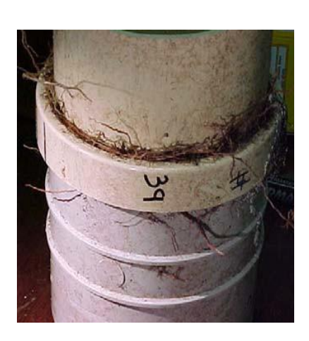
FIG. 11 MELALEUCA ROOTS GROWING IN THE CREVICES AT THE SOCKET OF A PVC JOINT