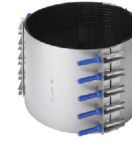
MULTI PART REPAIR CLAMP

Clamps specified for HDPE pipe application should be regarded as an OD Clamp