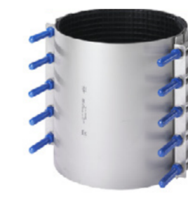
DOUBLE PART REPAIR CLAMP