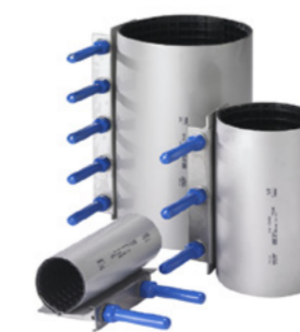
SINGLE PART REPAIR CLAMP